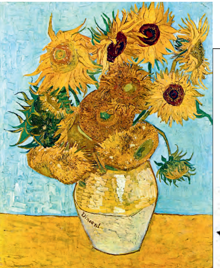
Reference image for example; images do not match.