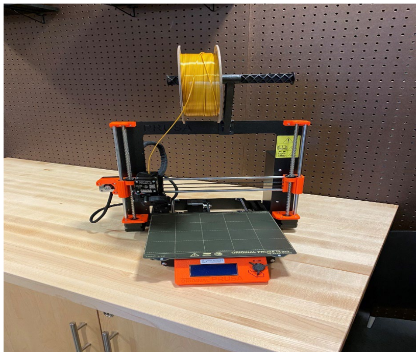
3-D Printer in MakeIT Lab

The Northville District Library introduced several new services in 2023. MakeIT, the Library's very own Maker Lab debuted on December 1 st . The new space offers 3-D printing, vinyl and paper cutting, sublimation printing and heat pressing, and laser cutting and engraving. All of these tools help users create, collaborate and learn and the NDL was delighted to be able to bring this technology to the Library for its patrons. The Library also partnered with the Northville Art House to offer a new patron book club, From Page to Palette . Participants in this club read fiction books based upon some of the most famous people in art history. The NDL expanded its partnership with the Northville Senior Center to offer technology classes on a quarterly basis. Last but not least, the Youth Department introduced the Talk, Text and Learn mobile app. This app provides daily tips to parents to help them prepare their children to attend school.