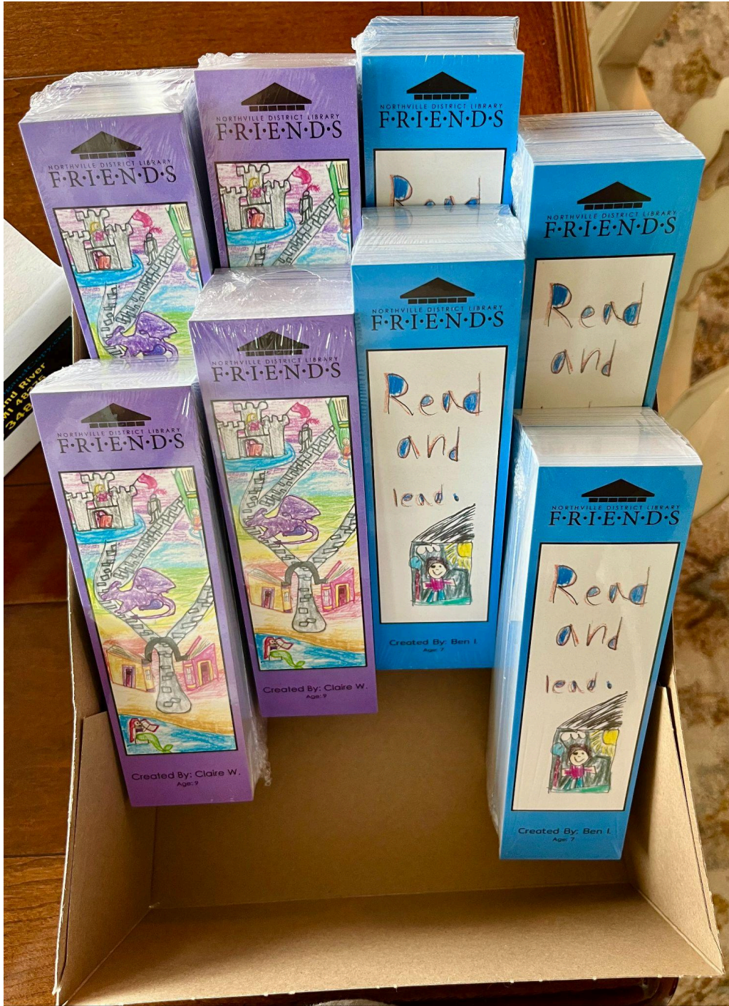
Friends of the Northville District Library's 2023 Bookmark Contest winners.