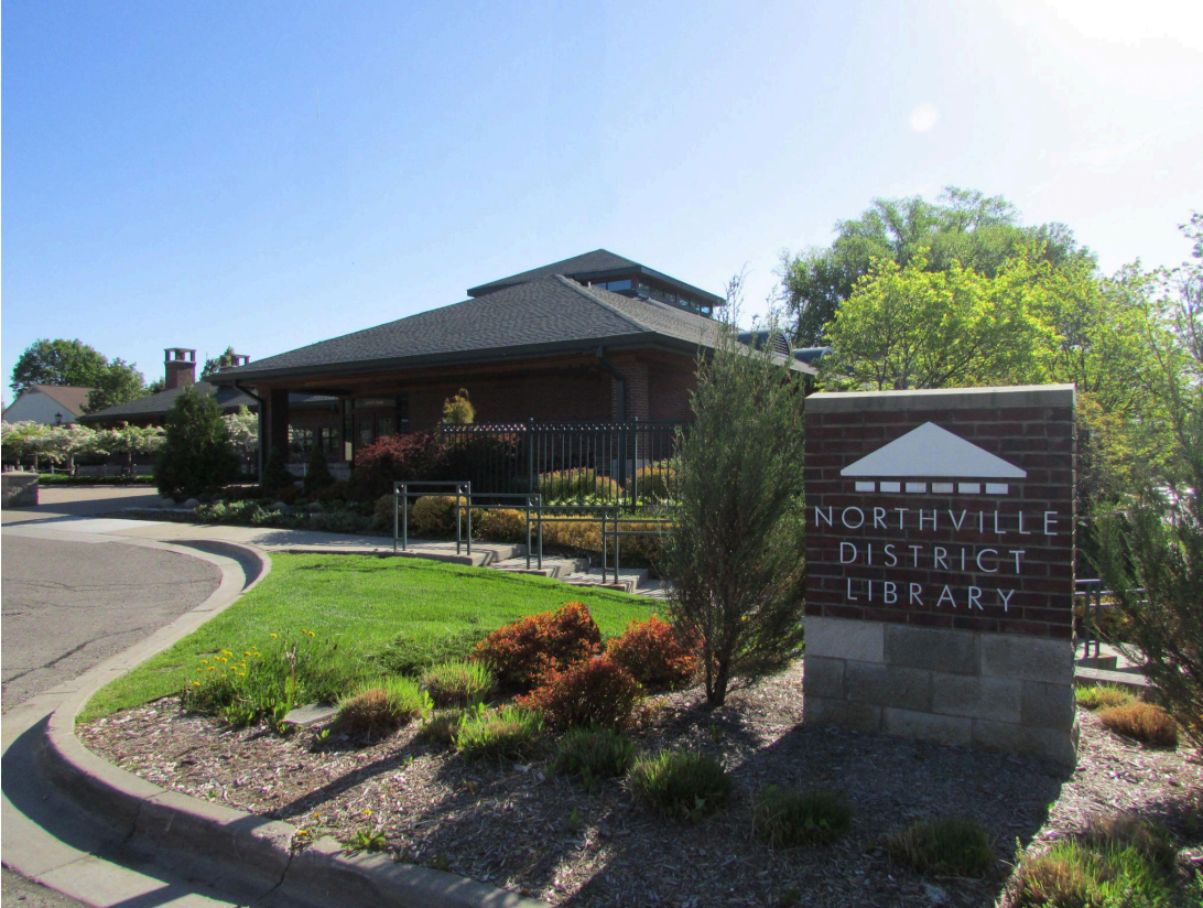
NDL exterior - view from the parking lot.