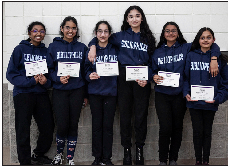
First Place: Bibliophiles

Teams of 4 to 6 students in grades 6 through 8 read from a selected set of seven books and compete to answer questions based on those books. Among the team, members read 1 to 7 books and participate in the final live competition. Teams create their own team names and costumes adding to the excitement. This year the Bibliophiles won. Congrats to them and to all who participated!