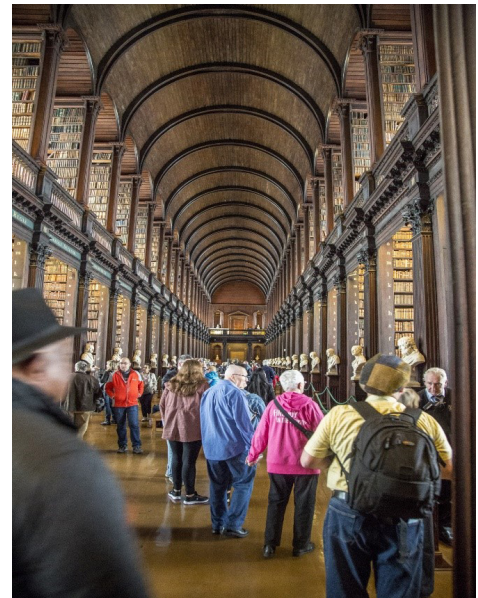
Trinity College Library Dublin, Ireland

Look around this Newsletter to see just a few of the opportunities, programs, and physical items paid for and supported by the Friends.