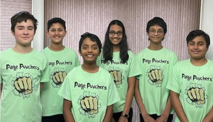
Page PUNCHERS placed first in this year's competition with a score of 224. Way to go, Page PUNCHERS!

Northville District Library's 15 th Annual Battle of the Books (BOTB), an exciting program for 6 th , 7 th and 8 th graders, took place on March 10 th . For the first time ever, the event was virtual. Eighteen teams of middle schoolers participated. All teams read a set of seven books and competed to answer relevant questions. They add to the fun by naming their team and dressing in costumes. The Friends of the Library once again sponsored the BOTB, donating a complete set of the seven books to each team.